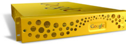
Figure 4 – Google Search Appliance – ten million docs in a box

As a counterpoint, Kimberly-Clark addressed their entire internal search needs with a few simple GSA boxes, each of which looks like this: